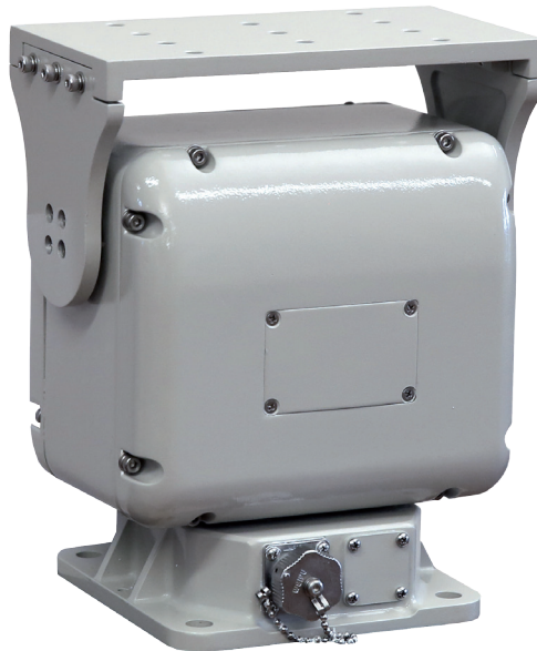
PT-1015CR or PT-1015, IP67 Max Load 10 kg

All specifications and product descriptions are subject to changes without notice.